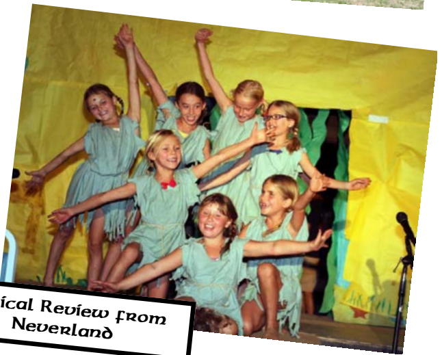
Musical Review from Neverland