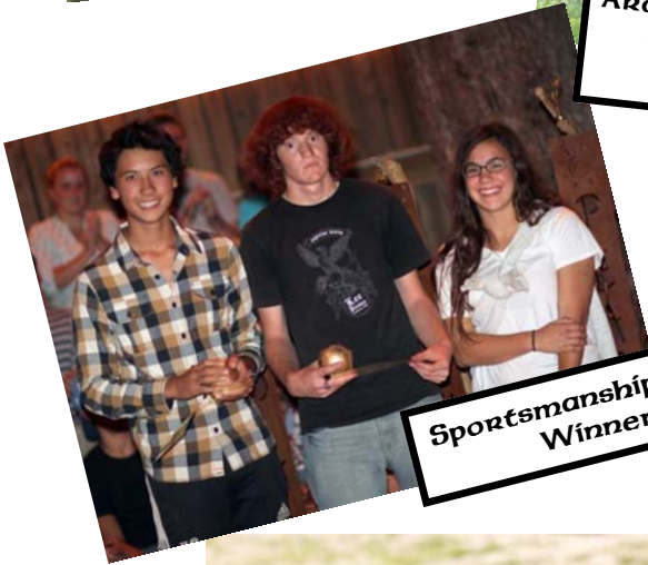
Sportsmanship Award Winners