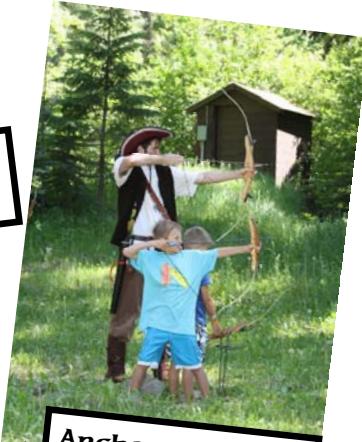
Archery at Place of the Blue Spruce